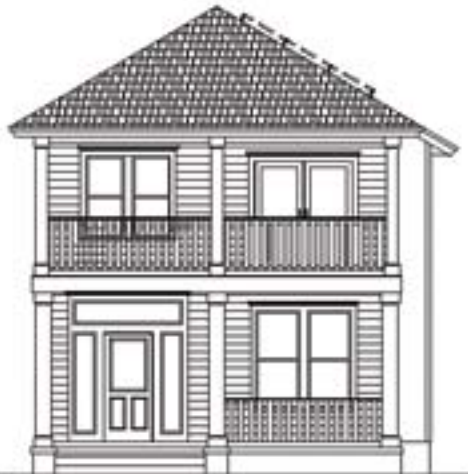
ELEVATION "C" - DOUBLE FRONT PORCHES