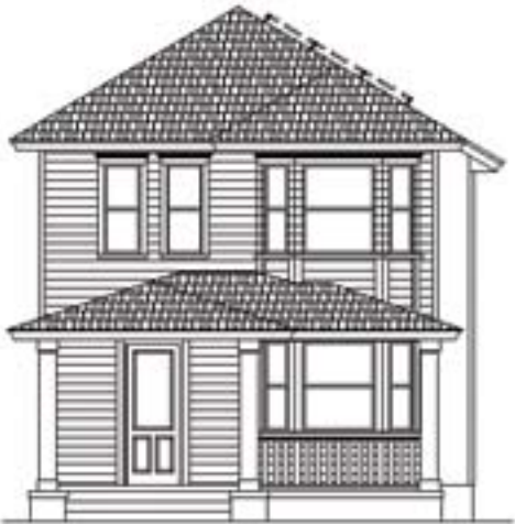
ELEVATION "B" - DOUBLE BAY WINDOWS