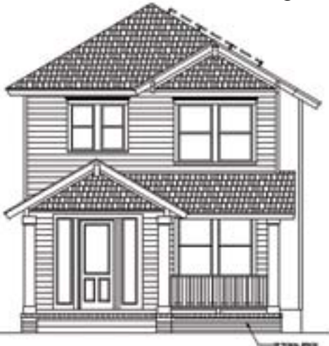
ELEVATION "A" - GABLE ROOFS